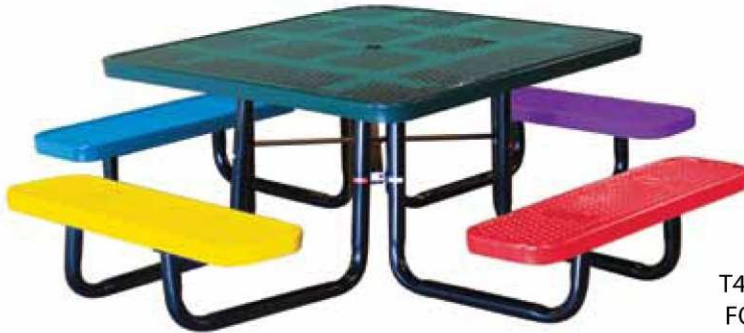
T46SQP-CHILD-PERF FOR SHOW OLNY